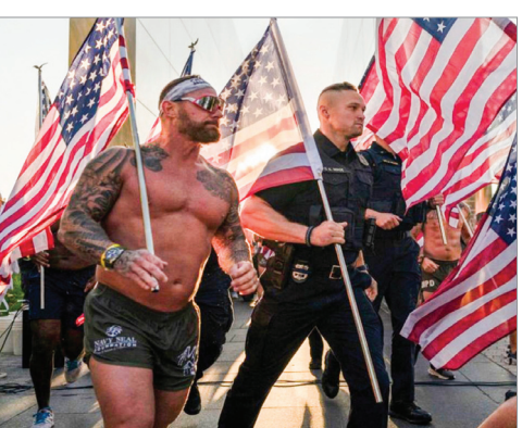
NJIT Officers supporting participants in the GI Go Fund U.S. Navy Seals 2 mile run.