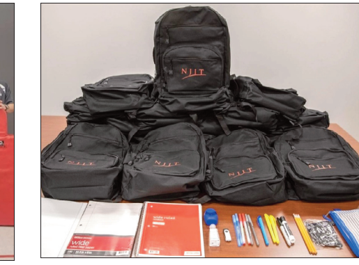
Book bags and school supplies donated by NJIT Public Safety at Newark charter schools.