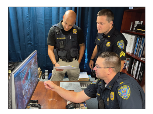
Detective Bureau reviewing incident reports and camera footage.