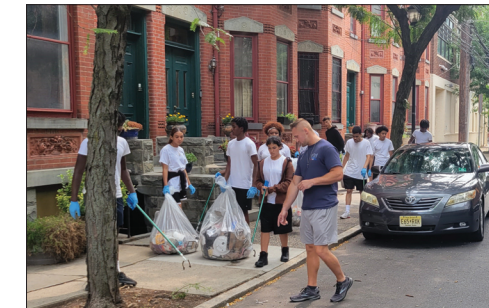
Officers and Junior Academy members at a neighborhood clean-up.