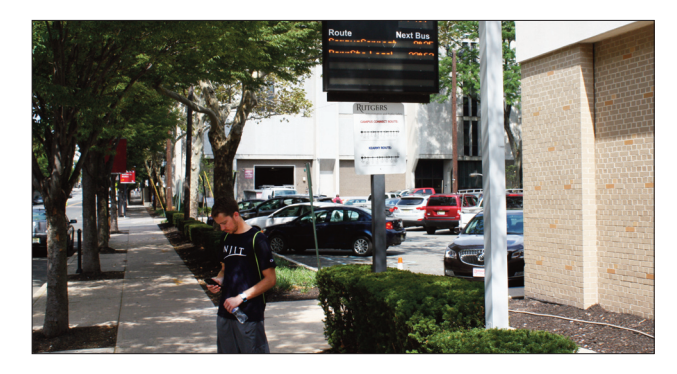
A student finds the next available bus time through his mobile phone at the NJIT stop of the shuttle bus.

The Newark College Town Shuttle service meets the daily transportation needs of all students, faculty and staff in the University Heights area. Serving NJIT, Rutgers University-Newark, Rutgers Biomedical and Health Sciences, Essex County College, University Hospital, Newark Penn Station and the Broad Street Train Station, the shuttle operates Monday through Friday from 7 a.m. to midnight. For detailed information, including route descriptions, maps and schedules, visit njit.edu/shuttle.