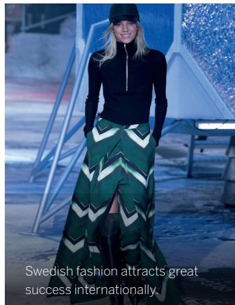
Swedish fashion attracts great success internationally.

Many Swedish companies have grown wealthy as a result of Swedish innovativeness, including Volvo, Ericsson, ABB, Tetra Pak, AstraZeneca and IKEA.